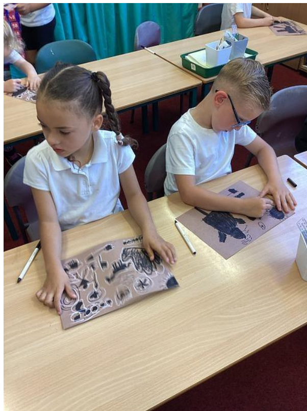
1 - World Cup Activities