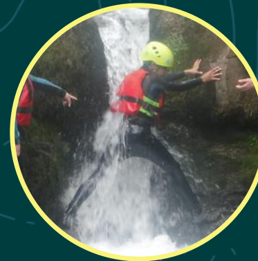
Real World Learning