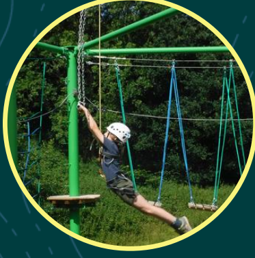
Learning new skills