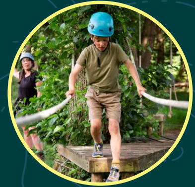
Learning how to manage risks