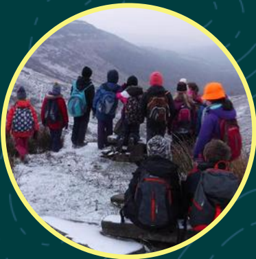
Responsibility & independence