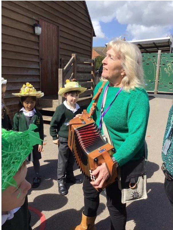
2 - Easter Bonnet Parade