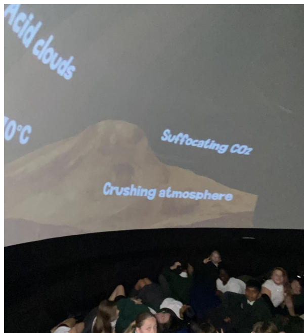
2 - Inside the Wonderdome!