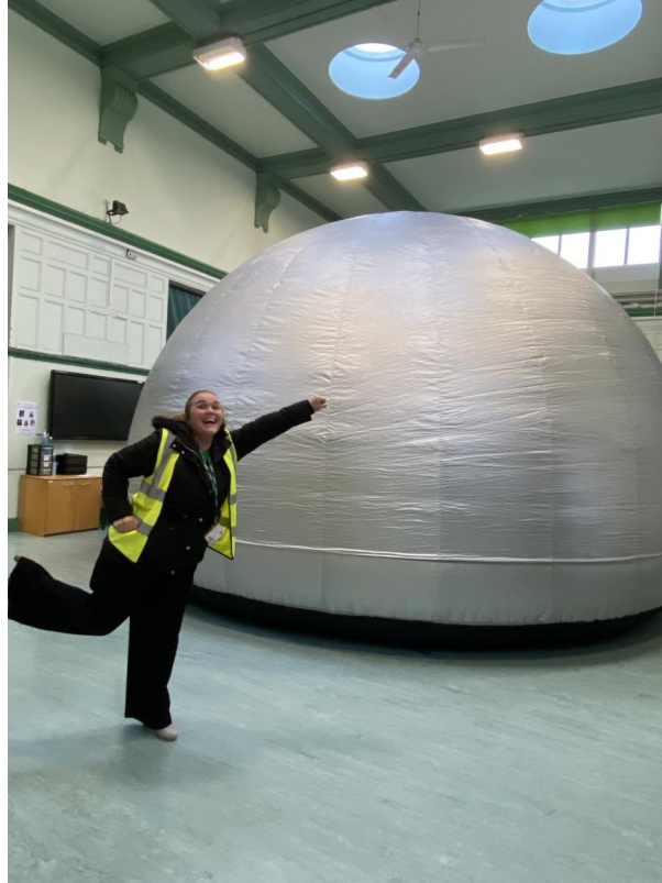
1 - Mrs Tinto about to take off into space