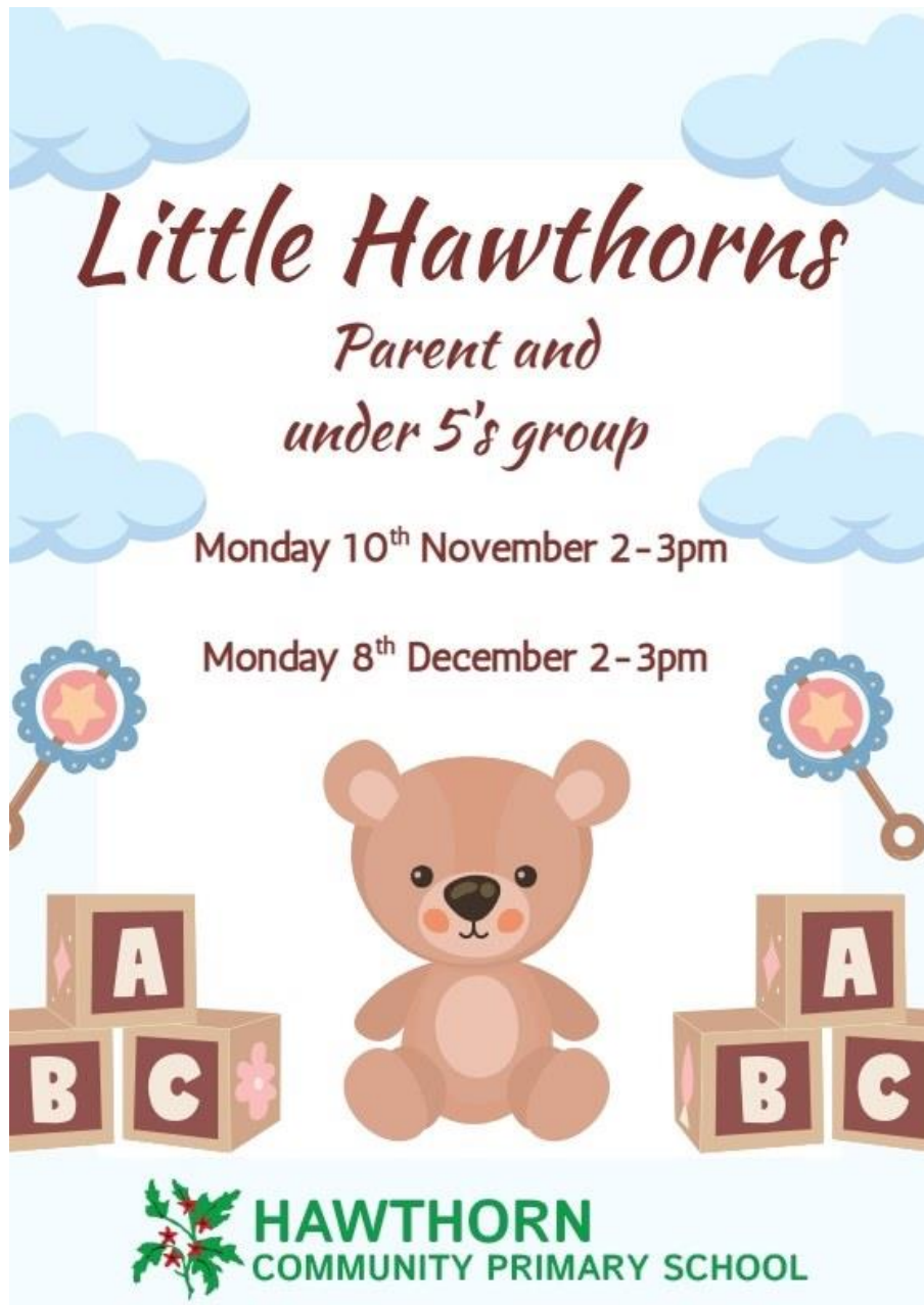
3 - Little Hawthorns